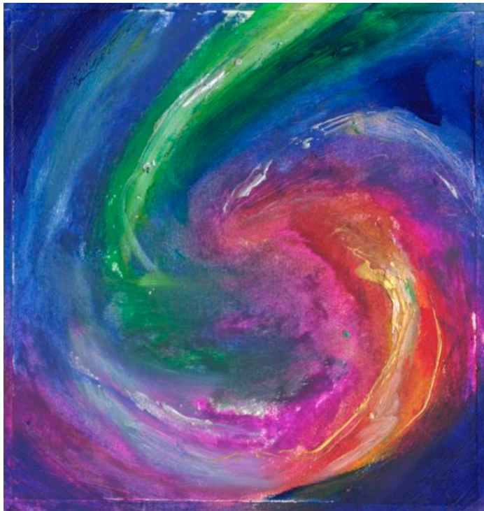
Transformation 4 Proposal Sketch Proposed size for original piece 200 x 150 cm