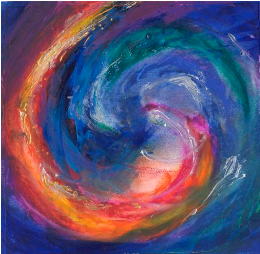
Transformation 5 Proposal Sketch Proposed size for original piece 300 x 250 cm