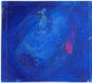
Transformation 1 Proposal Sketch Proposed size for original piece 90 x 75cm

The series of paintings start with a single figure: