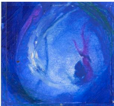
Transformation 2 Proposal Sketch Proposed size for original piece 120 x 100 cm

You can see the beginning of deep purples and greens being formed, which is symbolical of dark light being split into the warmer elements of the spectrum. As we make decisions, we begin to create life.