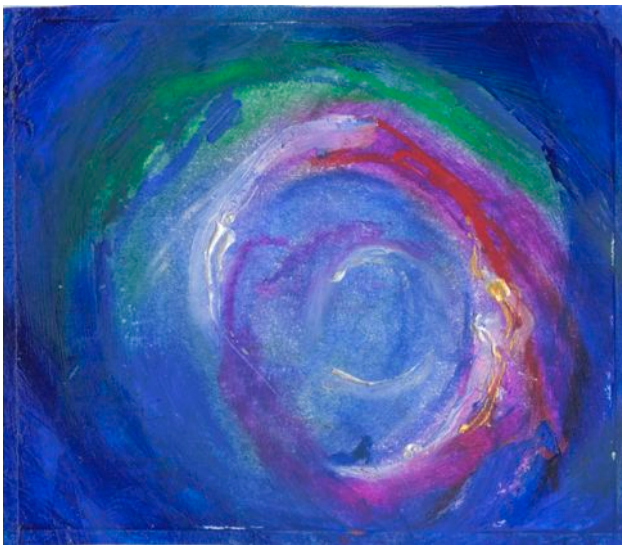
Transformation 3 Proposal Sketch Proposed size for original piece 150 x 120 cm